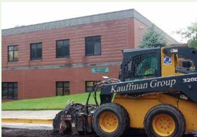
The Kauffman Group donated an $8,000 repair to our bus circle!